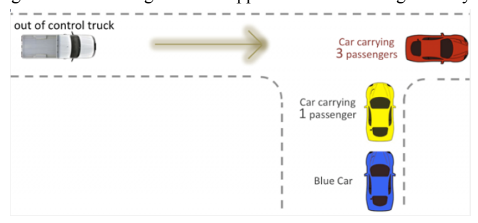
Figure 1: Diagram of traffic situation that was shown to participants for the Push dilemmas. The blue car is either an autonomous vehicle or is driven by a human driver, and must choose whether to push the yellow car into the path of the truck.

"... In fact, there are thousands of possible dangerous traffic situations whose precise characteristics one cannot possibly anticipate. It is therefore crucial that the driverless car be equipped with a computer program that implements general rules designed to be applicable across a large variety